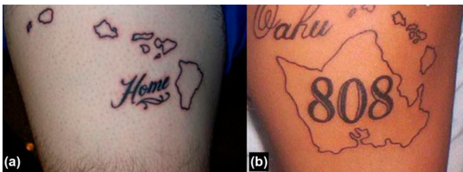
Figure 1. Map of Hawaii on local men found in Rank My Tattoos forum. (a) Carry a piece of home around with me . Accessed August 1, 2012. http://www.rankmytattoos.com/Hawaii/Honolulu/14579.html . (b) This is where I'm from . Accessed August 1, 2012. http://www.rankmytattoos.com/tattoo-designs/hawaiian-tattoo-11530296811616.html .

(1) Carry a piece of home around with me , 8/5/2007 2