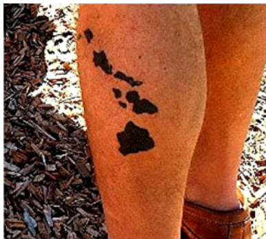
Figure 2. Map of Hawaii on non-local Caucasian men found in Flickr. The Hawaiian Islands with you everywhere!